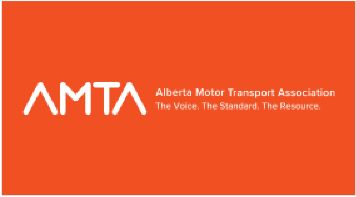
Reverse-colour tagline signature