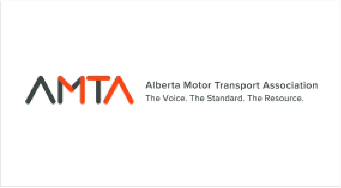
Full-colour tagline signature