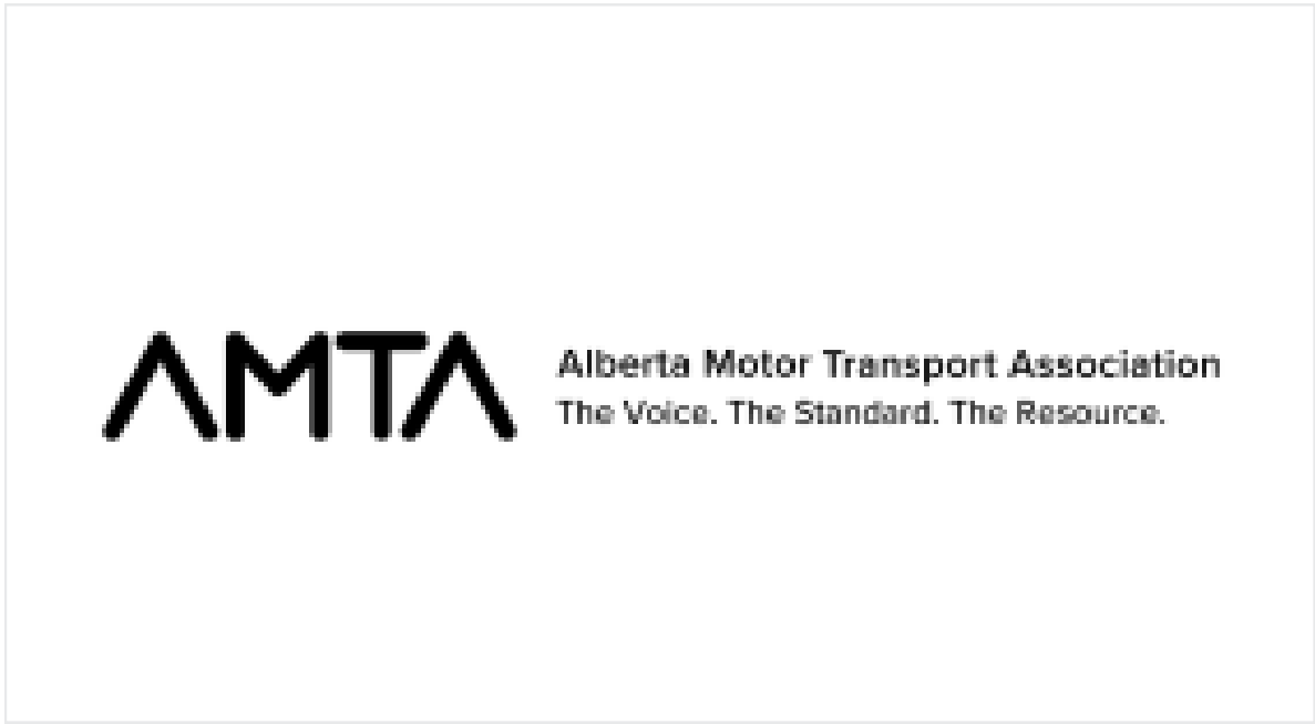
Black tagline signature