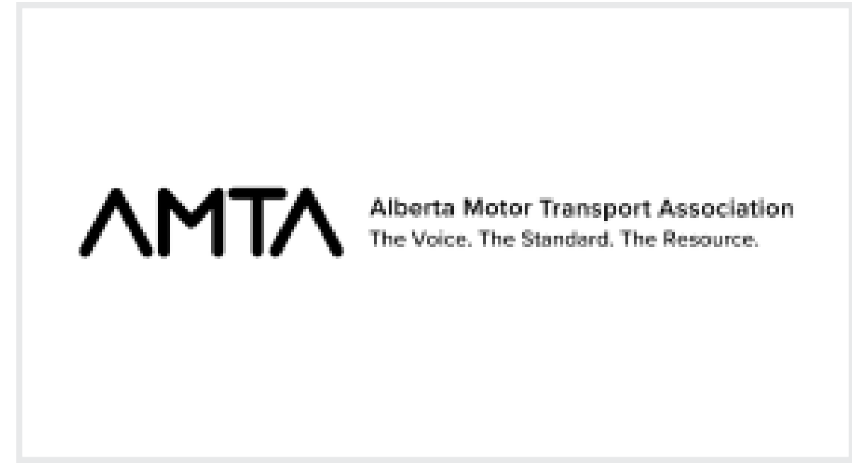
Single-colour tagline signature