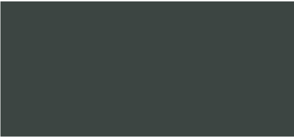
PANTONE® 446 C C75 M57 Y61 K32 #3b4542