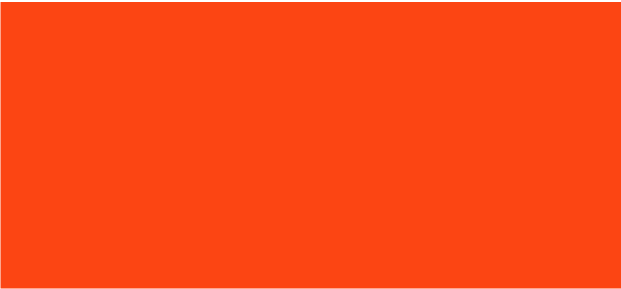
PANTONE® 172 C C0 M84 Y91 K0 #ff4612

AMTA is represented in two (2) principal colours and four (4) secondary colours. Each of the colours has a corresponding Pantone® value, a four-colour process (CMYK) breakdown, RGB values for digital reproduction and a Hex value specifically for online use. These colours are important to the brand identity system and must never be adjusted.